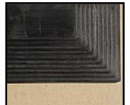
BEVELED MALE/FEMALE RAMPS AVAILABLE